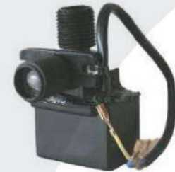
Custom Design Electrovalve

* Dust filter system is very easy to use.